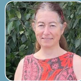
Sandra Hey Minor Cereals & Oilseeds Legumes Outdoor cucurbits Sweetcorn Stem veg