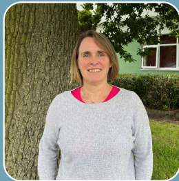
Kim Parker Field vegetables Root veg Brassicas Leafy salads Herbs