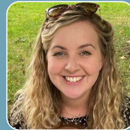
Grace Emeny Protected Edibles Tomato, Pepper, Cucumber Mushrooms Leafy salads Herbs